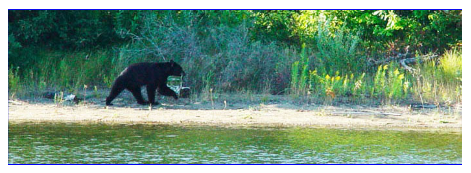
Black bear strolling the shore at Bear's Bottom.

There is an old cottage on the far northeastern shore, and a heavily used cottage on the eastern shore. Along the north shore there is a small sandy beach and a bench. There are usually good blueberries in season. It's an easy dinghy trip into Bear Fall Cove and Beardrop.