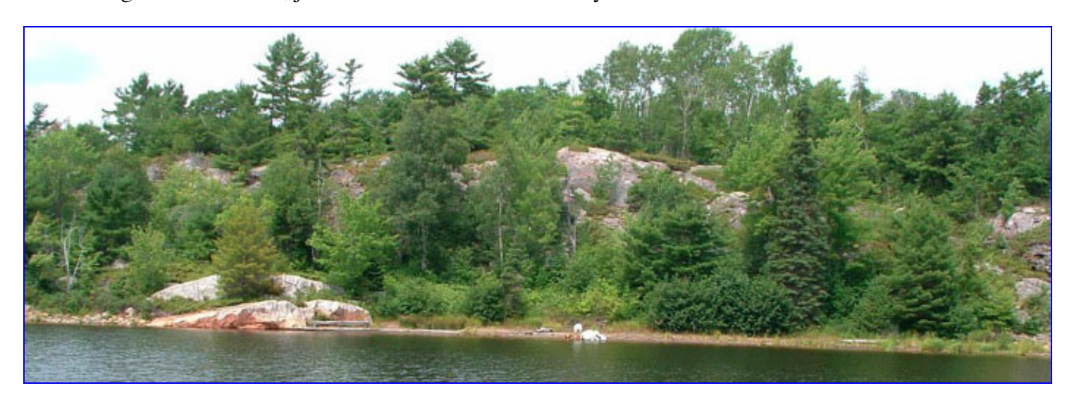
Sandy beach at Bear's Bottom Bay.

The cove gradually shallows from 13-14' at the entrance to 5-6' in the northwest corner. Anchor in 8-10' in the middle of the cove. There's room for 2 or 3 boats to swing. Note that there are some rocks along the south shore, just off the reeds. Bottom is clay.